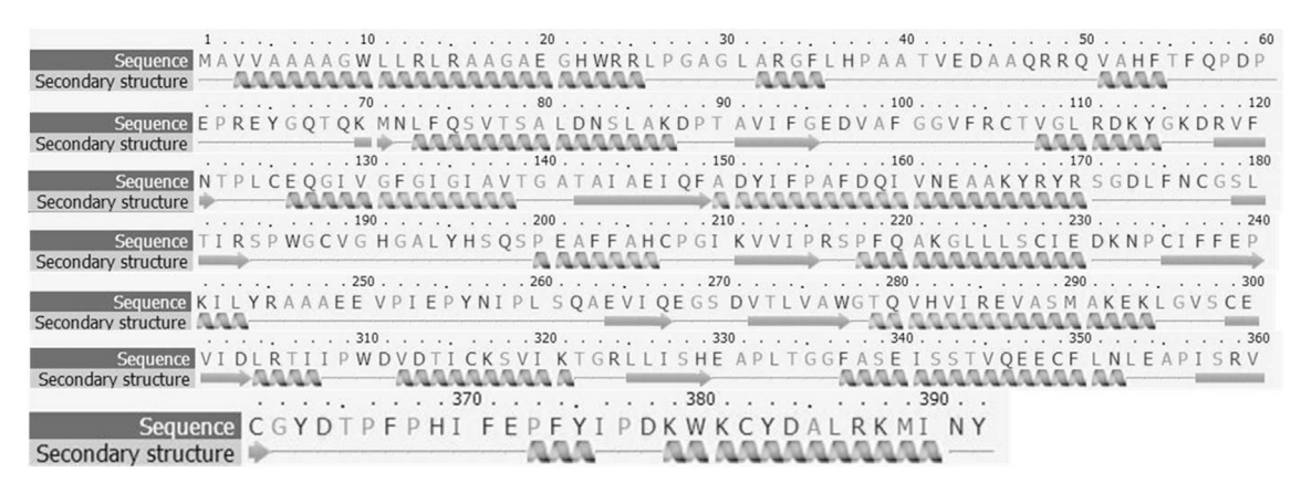
Figure 4 The boy with MSUD was able to sit unaided at the age of 10 months.

Neurological sequelae are common in MSUD patients. The accumulation of branched-chain amino acids (especially leucine) and \alpha -ketoacid by products are considered to be the main neurotoxic metabolites. It has been postulated that metabolite accumulation in MSUD causes demyelination, inhibition of brain energy metabolism, induction of