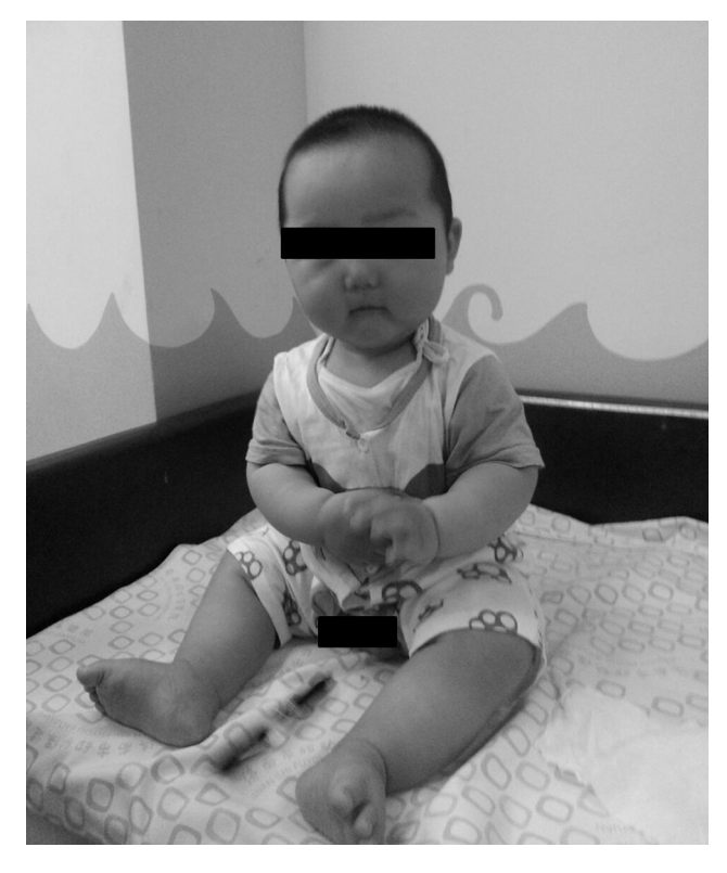
Figure 3 The secondary structure of BCKDH E1-beta was shown.

intermediate MSUD have markedly increased BCAA levels and neurological impairment (such as feeding problems, mental retardation and developmental delay), and they may present much later in life. In our study, the boy was admitted to hospital due to irritability and opisthotonuslike posture at the age of 40 days. Based on the clinical presentation and later onset, the patient might be classified into intermediate form. Severe leucinosis, brain swelling, and death can occur if individuals with intermediate MSUD are subjected to sufficient catabolic stress. Therefore, the distinction between classic and intermediate type is not absolute. Furthermore, other modifying genes may affect clinical presentation of MUSD. For example, the kidney of the child may do a better job to clear acid or have may be a better buffer system.